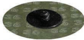
TYPE R ROLL-ON STYLE

Best product to compete against Roloc™ two ply cloth products.