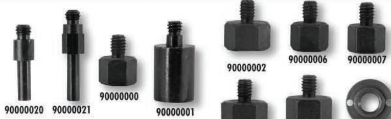
Trim Kut® Mandrel and Adapter/Nuts