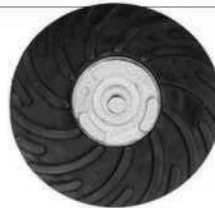
SPIRALCOOL RUBBER RESIN FIBRE DISC BACKING PADS