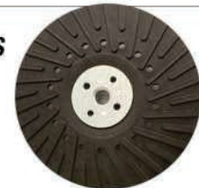
POLY AIR-COOL PLASTIC RESIN FIBRE DISC BACKING PADS