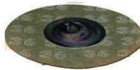
TYPE S SCREW-ON STYLE

Rapid Change Holders Type S Metal Screw-on Locking Style