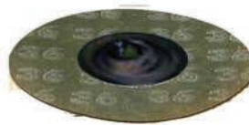
TYPE S SCREW-ON STYLE

Rapid Change Holders Type S Metal Screw-on Locking Style