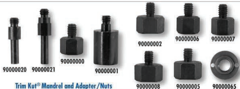
Trim Kut ® Mandrel and Adapter/Nuts