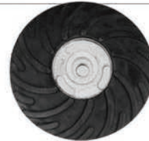
SPIRALCOOL RUBBER RESIN FIBRE DISC BACKING PADS