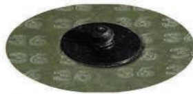
TYPE R ROLL-ON STYLE

Best product to compete against Rolo TM two ply cloth products.